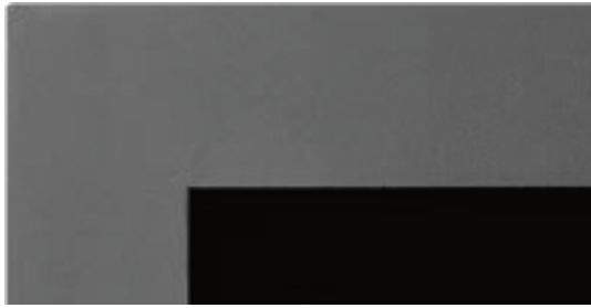
1-piece finishing trim