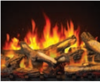
Premium glowing split oak logs