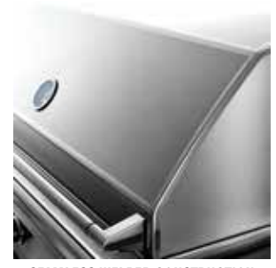
SEAMLESS WELDED CONSTRUCTION