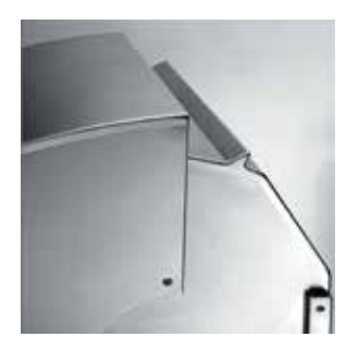
HEAT STABILIZING DESIGN