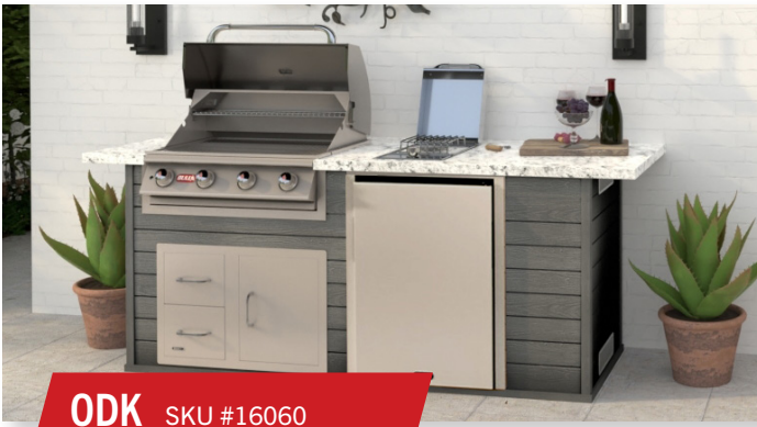
ODK SKU #16060