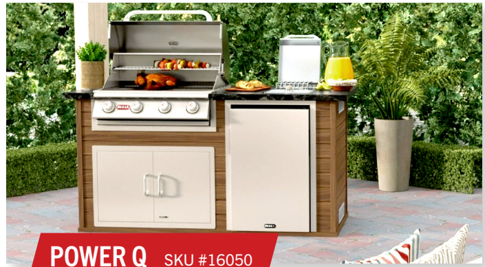
POWER Q SKU #16050