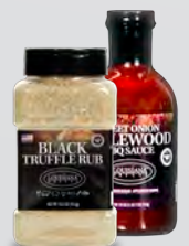
SPICES & SAUCES